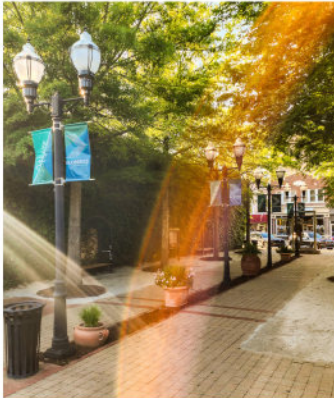
Evans Street Breezeway Refresh