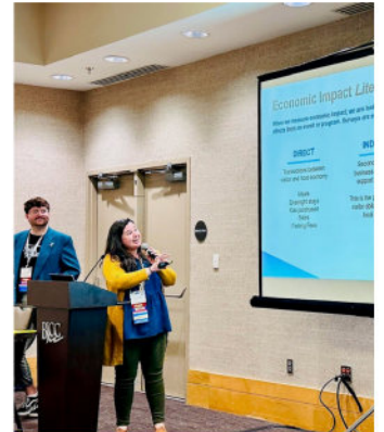
Main Street NOW

As an Accredited Main Street Community, Downtown Florence's Main Street Program follows the Main Street Approach™, made up of four focus areas, Design , Promotion , Economic Vitality , and Organization . This preservation-based economic development model is practiced by a network of over 1,200 communities nationwide.