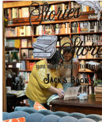
Jack's Books Store Opening