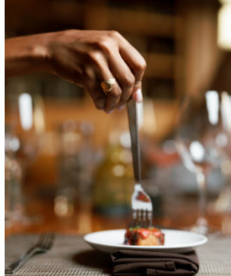
Downtown Restaurant Week